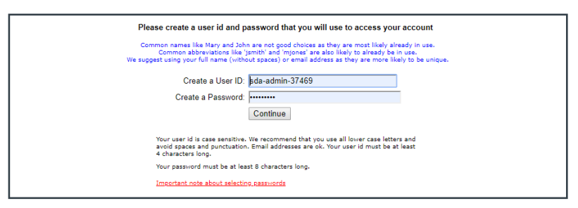
Already have an account?